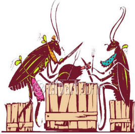
There is help from these pests